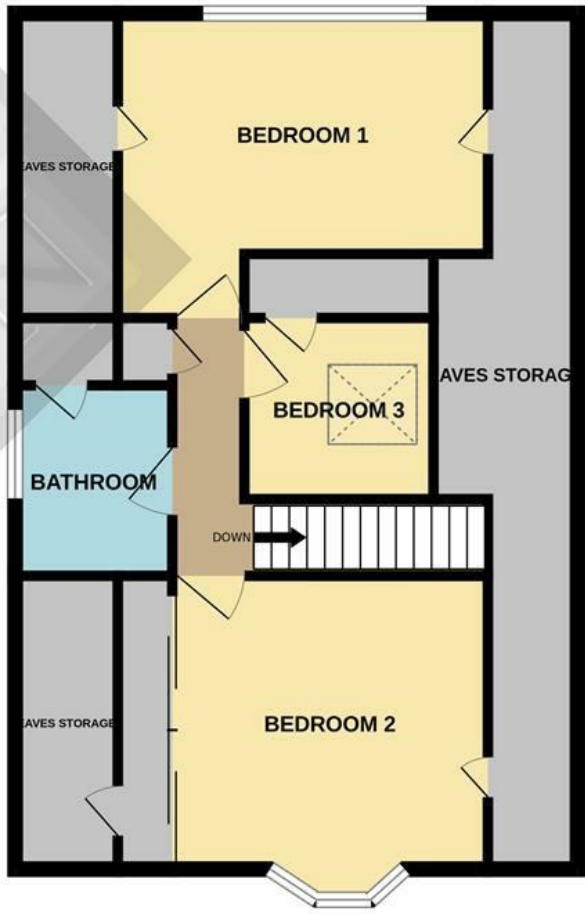
1ST FLOOR 668 sq.ft. (62.1 sq.m.) approx.

TOTAL FLOOR AREA : 1730 sq.ft. (160.7 sq.m.) approx.